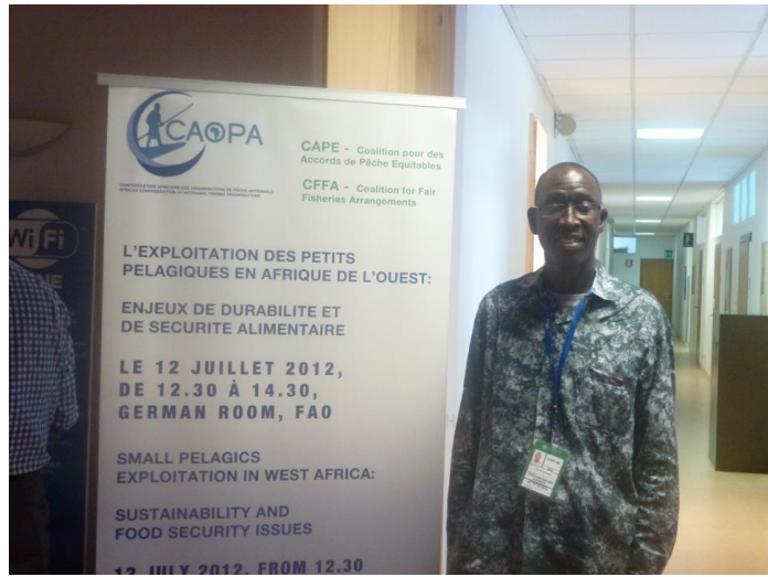
CFFA CAOPA side event poster

The objective of this meeting was to have an overview of the situation of small pelagic fisheries in West Africa and their vital role for regional food security, both in terms of fish food supply for direct human consumption and as a source of livelihoods and income, highlighting the difficulties encountered in these last years. As a matter of fact, of particular concern is the increase in investments and fishing intensity by distant water fishing fleets. These developments may be related to trends in small-pelagic fishing in Latin America, and also growing demand for small-pelagic as a source of fishmeal and fish oil, including for agriculture and aquaculture production.